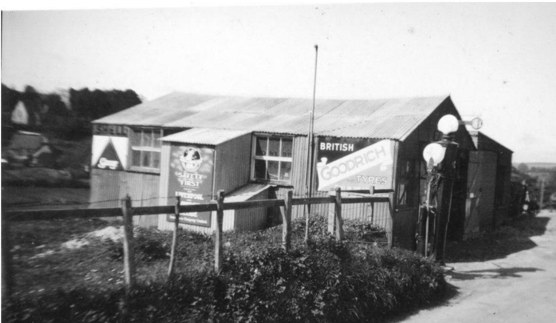
Gylven Garage circa 1922