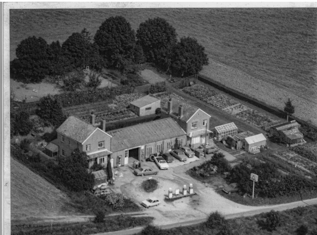
Aerial photograph circa 1950s/60s, photograph courtesy of Peter Booth